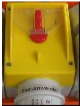
Figure 2: Main switch